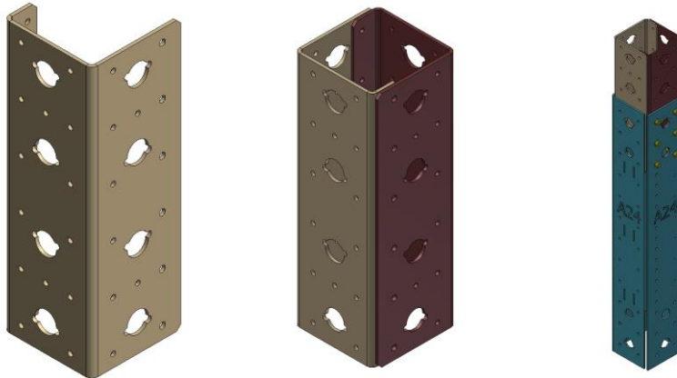
Figure 3: A screen-shot from Autodesk Inventor of a 3D model of a components and its assembly model prior to site delivery.

Once fabrication is completed, the assembly process is initiated two phases: pre-assembly in-factory and on-site assembly. In parallel with fabrication progression, the engineering team works on pre-assembly instructions, thus documenting quantities of families and hardware components, steel parts, fasteners, as well as precise sequential assembly procedures (Figure 3). Accordingly, the process becomes a predefined systematic practice that leverages quality, saves time, and minimize waste remarkably, toward a sustainable model.