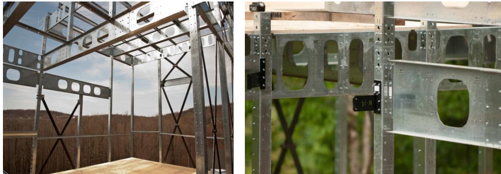
Figure 1: An overview of the structural system, and a close-up for one of the connections.

All components have an overall length of maximum ten feet in order to facilitate procurement. Structural columns have a composite square profile, 4 inches x 4 inches, assembled in plant employing self-tapping screws. An additional H-shaped profile can be added on the exterior side of columns to enhance their resistance to lateral loads. Stronger members are designed using a thicker material whenever required. Figure 1 represents views of the structural system components.